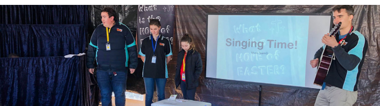
Singing time at Easter Camp kid's program

In 2017, the executive committee considered counsel from Ellen White relative to camp meetings such as the following: