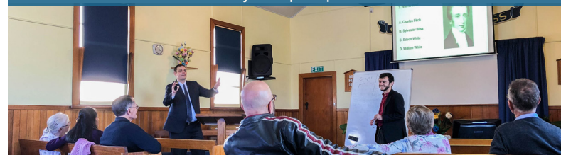
Wynyard Church members brushing up on some Seventh-day Adventist Church history through a fun multiple choice