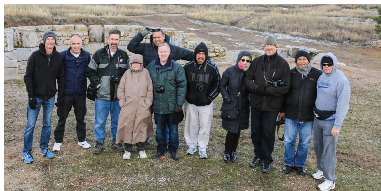
Dressed for the snow at the ancient church of St Paul in Pisidian Antioch, Turkey

aim of our Schools, Youth & Pathfinder ministries, Sabbath Schools, Health ministry, ADRA work and Women's Ministry. Our marching orders and our priorities have been clearly given us by God: