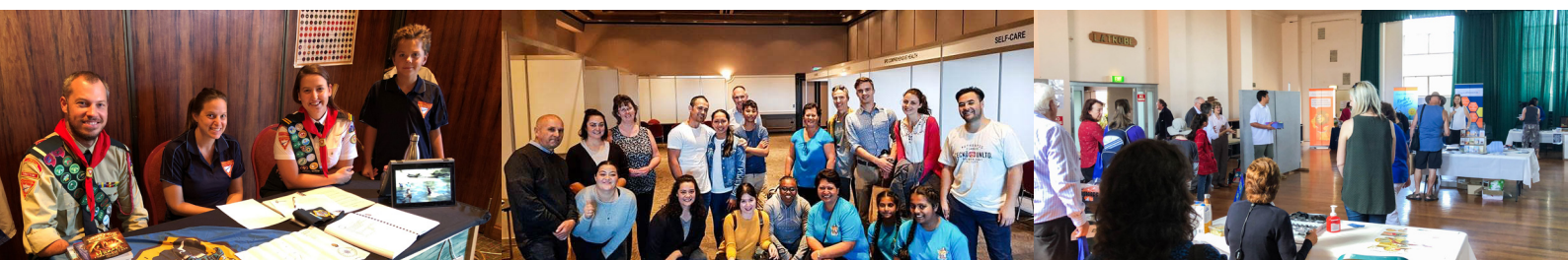
Pathfinders at their booth at the Launceston Expo