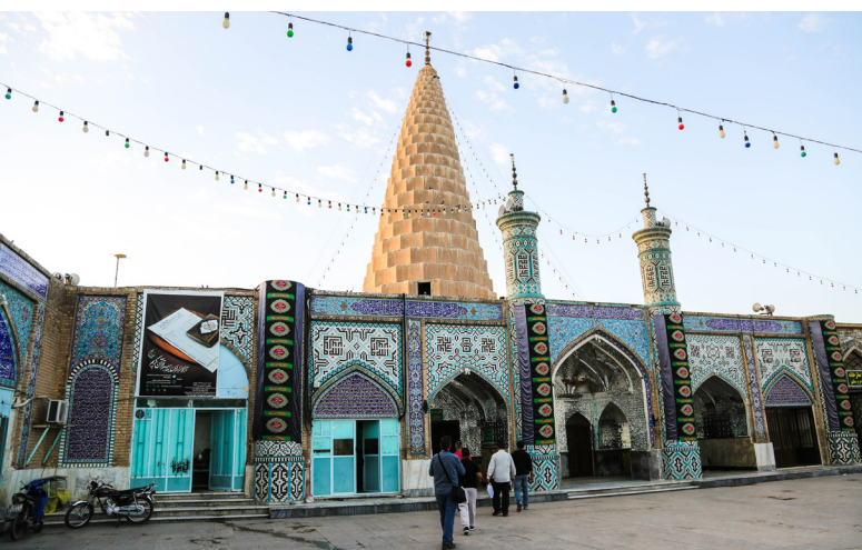
The tomb of Daniel in Susa, Iran

Daniel's tomb is also claimed to be in Susa. When he discovered that the time for the Jews to return to Jerusalem had arrived after seventy years of predicted captivity in Babylon, Daniel fasted and prayed earnestly to God for Israel's deliverance (Daniel 9:2,3). Pouring out his heart, he confessed his and Israel's sin in forsaking God's commandments and not following His prophets (Daniel 9:4-6).