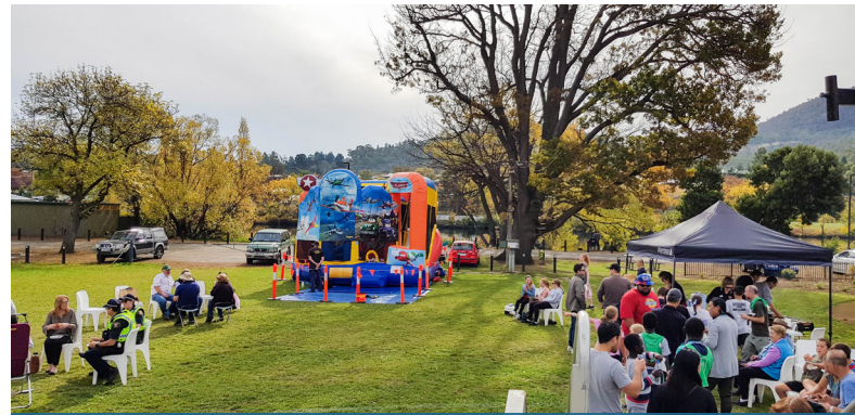
Camp barbecue & jumping castle for the community at the Easter Camp

A mistake has been made in holding camp-meetings in out-of-the-way places, and in continuing in the same place year after year. This has been done to save expense and labour; but the saving should be made in other lines. Ellen G White, Gospel Workers p 400.