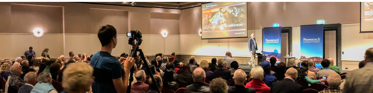
A full house at Prophetica 2019