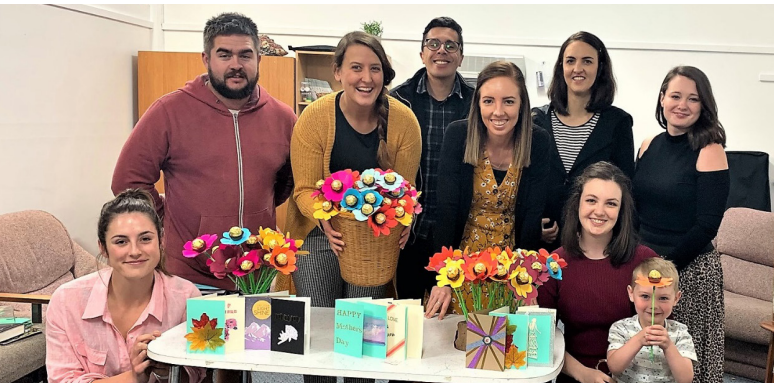
Launceston Youth with the goodies they made for Mother's Day

Launceston youth and some helpers spent Mother's Day creating chocolate flowers and handmade cards for some of the older and forgotten, mums of our church. They also made a visit to the Launceston General Hospital maternity ward to wish all the new mums congratulations and a happy Mother's Day. Thank you to all these lovely people who gave up some of their own time to make others feel wanted. Well done Launceston youth for a great initiative and team effort.