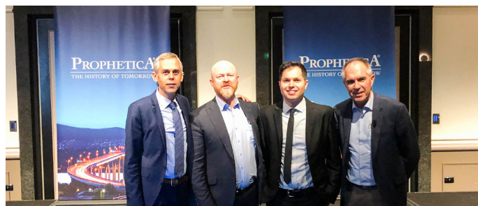
The Prophetica 2019 Presenters