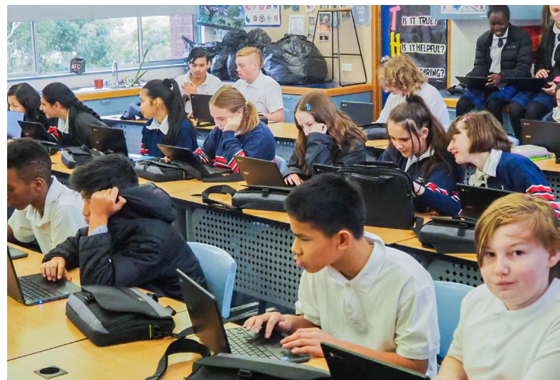
Students with their Chromebooks