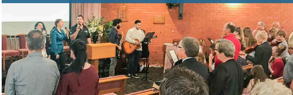
Youth lead worship at Ulverstone SDA Church during the Youth Rally