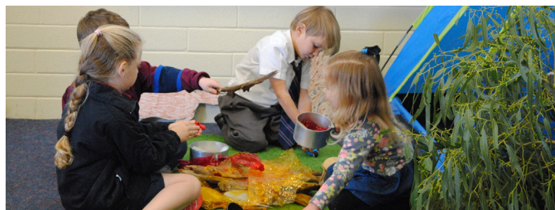
Kids at NWCS playgroup

Monday mornings are a hive of activity in the Multi-Purpose Room and the playground as those aged from 0-5 enjoy a play based discovery gathering. This is organised and run by Belinda Ackland. These young children thoroughly enjoy the activities and look forward to coming each week.