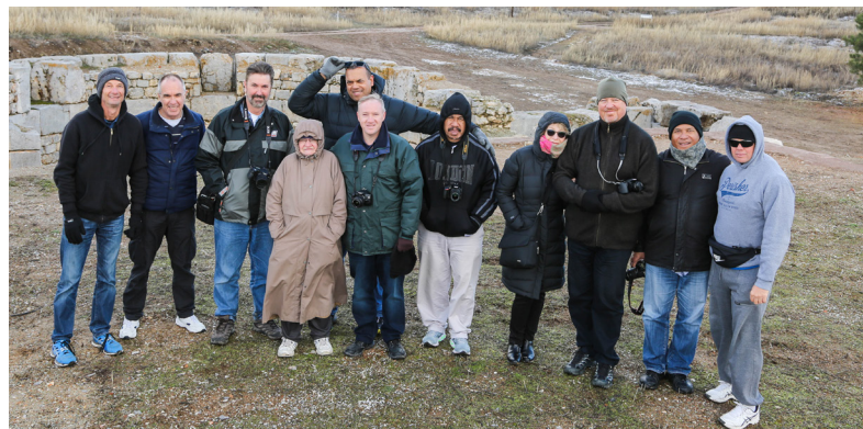
Dressed for the snow at the ancient church of St Paul in Pisidian Antioch, Turkey

aim of our Schools, Youth & Pathfinder ministries, Sabbath Schools, Health ministry, ADRA work and Women's Ministry. Our marching orders and our priorities have been clearly given us by God: