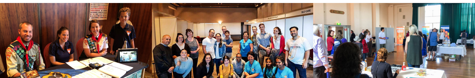
Pathfinders at their booth at the Launceston Expo