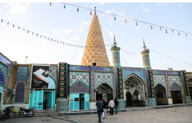
The tomb of Daniel in Susa, Iran

Daniel's tomb is also claimed to be in Susa. When he discovered that the time for the Jews to return to Jerusalem had arrived after seventy years of predicted captivity in Babylon, Daniel fasted and prayed earnestly to God for Israel's deliverance (Daniel 9:2,3). Pouring out his heart, he confessed his and Israel's sin in forsaking God's commandments and not following His prophets (Daniel 9:4-6).