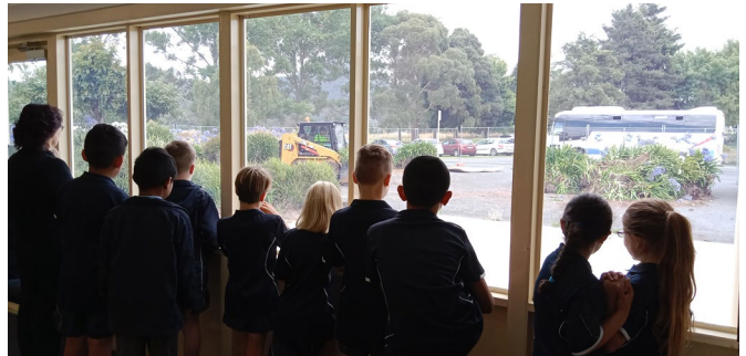
Students watch the start of the next phase of construction

Excited students gazed out the window watching the beginning of the next phase of North West Christian school expansion. They watched as the builders begin to prepare the ground for the building of the Performing Arts Centre.