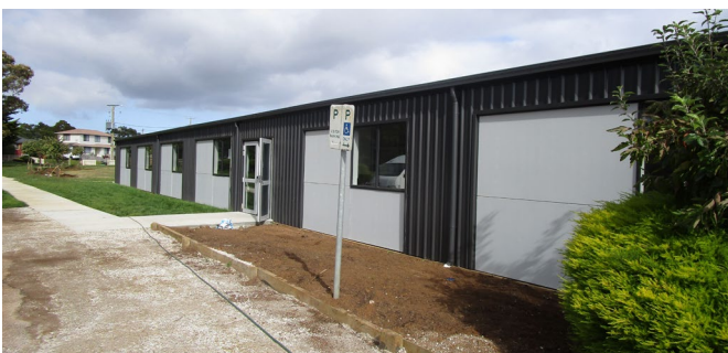
New senior classrooms

As 2021 came to a close there was only one more task needed to complete the construction of the senior classrooms, which was a job requiring TasNetworks to finish putting in a substation. Classes for 2022 began on February 2 with staff and students enthusiastic about being able to use the new senior rooms. As you drive onto campus the new extension looks impressive and enhances the atmosphere of the school.