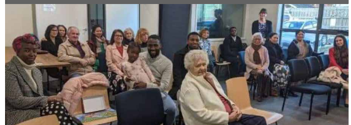
COMBINED FELLOWSHIP AT HOBART FELLOWSHIP