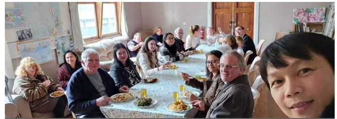
FIRST COMBINED FELLOWSHIP AT NEW NORFOLK

Let's look to the future with hope, unity, and unwavering faith. Blessings to you all.