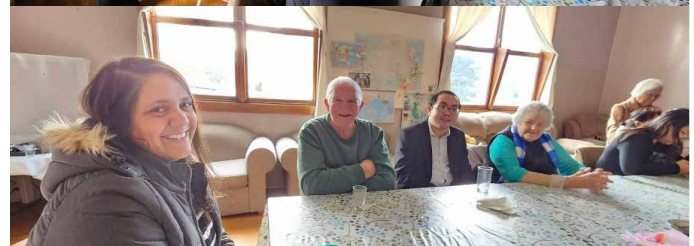
SECOND FELLOWSHIP AT NEW NORFOLK