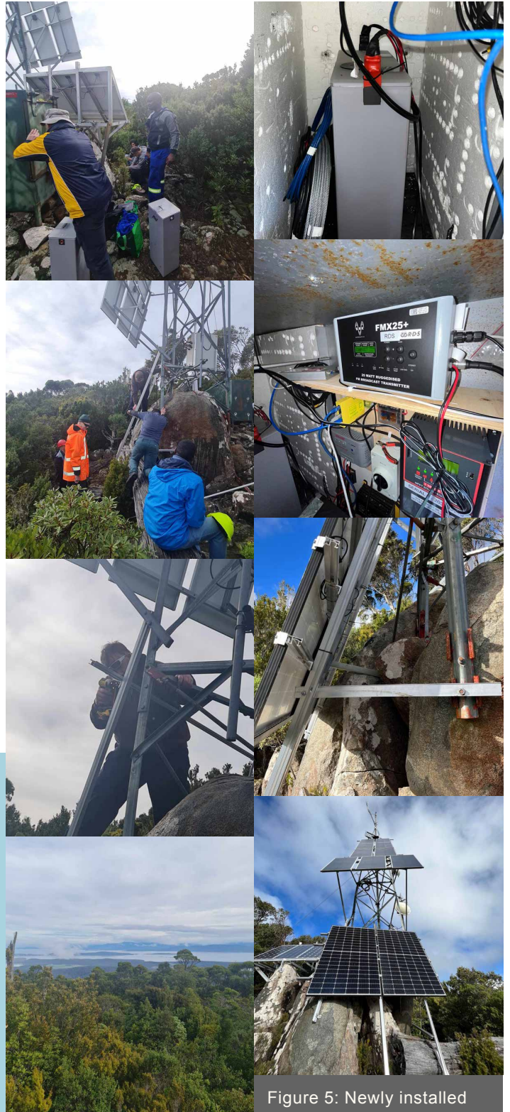
Figure 1: Jason, Prince, Rafael and Theo; Figure 2: Alan, Anthony, Nathaniel, Nigel and Russel; Figure 3: Russel installing Solar Panel mounts; Figure 4: The beautiful view